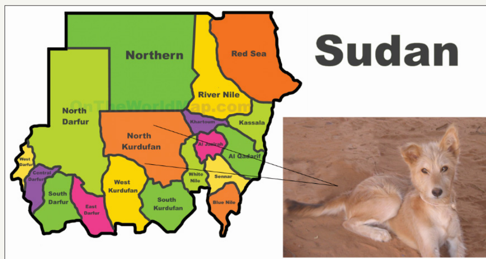
Figure 1: KABABISH DOGS; Local dogs type from North Kordofan area

The highest performing individuals (3 males and 3 females) were bred together and seven puppies of their offspring were selected to the same training program. The next generation puppies were successfully passed the first and second training phases and four of them successfully passed the final training phase.