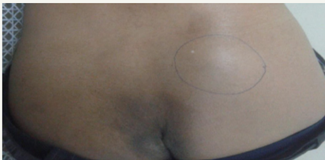
Figure 1: Photograph showing the tender s/c mass of size 4x3cm, firm, freely mobile, on the right gluteal Region.

A 60M presented with total recurrent painless gross haematuria with passage of clots for one year. No history of LUTS. GPE-normal. LE-tender s/c mass of size 4x3 cm, firm, freely mobile, on the (R) gluteal region, local tempt normal (Figure 1) [3].