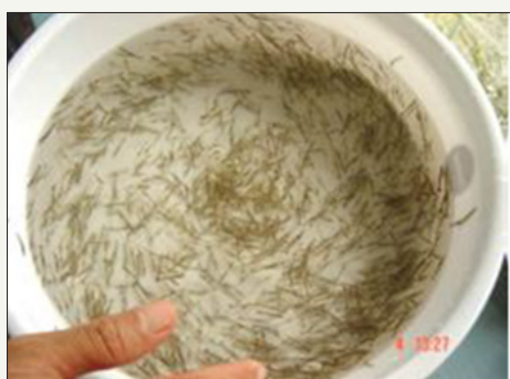
Figure 11: Good quality post larvae.

D. Post larvae used to acclimatize properly and carefully in farm with tank system prior to stocking inside the ponds for optimum survival rate.