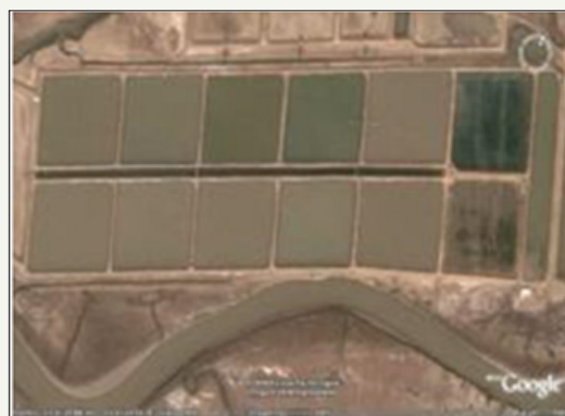
Figure 2: A well constructed farm in Surat area showing settlement, reservoir and culture ponds with 5:20:75 ratio.