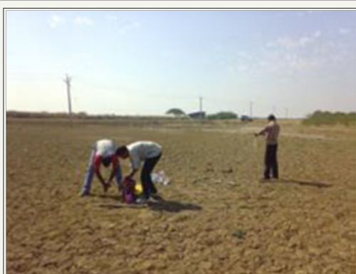
Figure 6: Proper drying of culture pond.