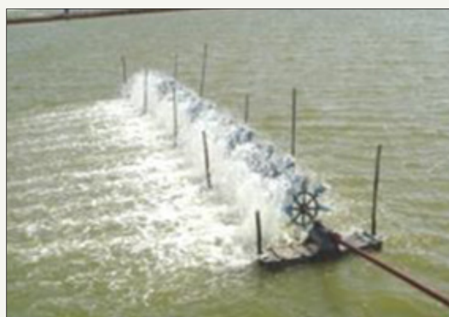
Figure 13: Good aeration in black tiger culture pond in Surat area.

F. Proper bottom chaining used to practice twice weekly to clean feeding area and also to release toxic gases for effective pond bottom management as given in following (Figure 13,14).