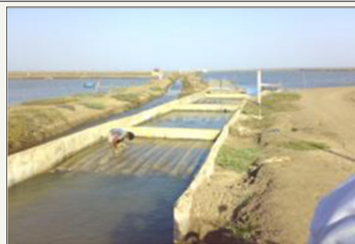
Figure 9: A filter unit consisting multiple filtration system in Surat area.