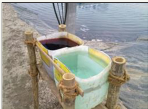
Figure 20: Hand wash before entering to the farm.