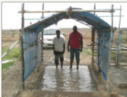
Figure 19: Foot wash before entering to the farm.