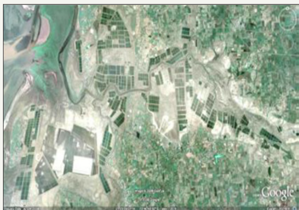
Figure 1: A developed site (Olpad) from Surat.

Site selection is very important factor of success for any industry. Surat is blessed with nearly 24300 hectares of brackish water area; suitable for aquaculture and from these presently, 1500 hectares of shrimp farms are developed with proper micro level survey by MPEDA and Govt. of Gujarat. In these entire sites were selected as per topography, climatic conditions, water quality, susceptibility or vulnerability to pollution, accessibilities and logistics. A developed and planned area from Surat is given in (Figure 1).