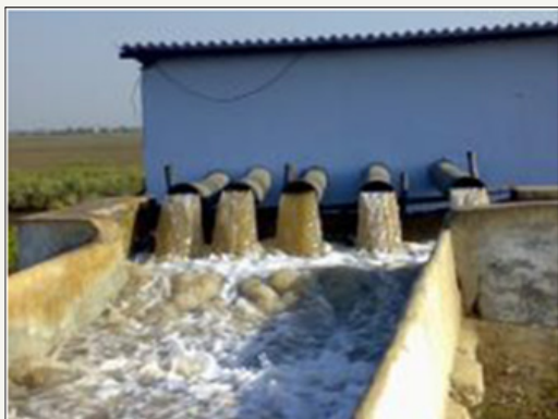
Figure 5: A farm showing pumping efficiency.