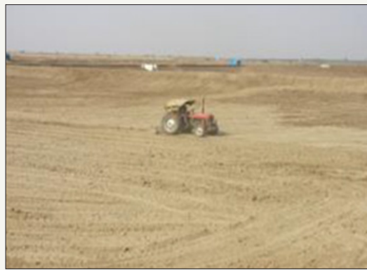
Figure 8: Compaction at pond preparation.