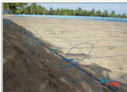
Figure 17: Bird netting to prevent birds inside culture ponds.