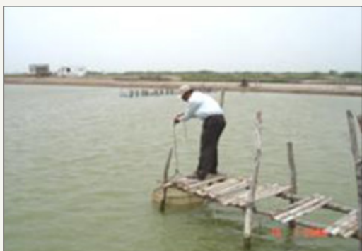
Figure 15: Checking of check tray by SAFA technical supervisor.