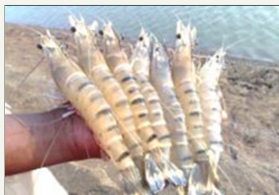
Figure 24: Good quality harvested shrimp.

Harvesting is the last and most important aspect of shrimp farming deciding the profitability of shrimp farms. It is vital to study proper market trend and rate before harvesting season. SAFA member farmers used to decide jointly to get the best price for their product from buyers. Harvesting used to do very carefully with minimum handling to maintain good quality of shrimp with hygienic conditions. Sufficient ration of shrimp to ice is used while packing and transporting to processing plant (Figure 21-24).