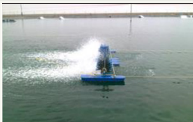
Figure 27: An experimental culture pond of white leg shrimp in Surat area.

B. SAFA has also welcomed the introduction of exotic white leg shrimp, Litopenaeus vannamei in Surat area as on experimental basis. Following figure shows an experimental white leg culture shrimp pond in Surat (Figure 27).