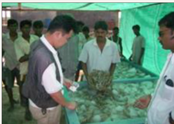
Figure 22: Post harvest practices in farm.