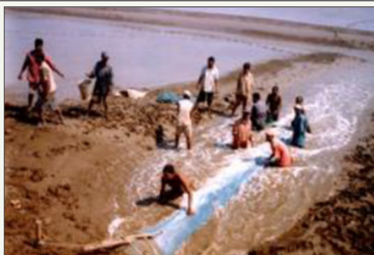
Figure 21: Complete harvest from drainage canal.