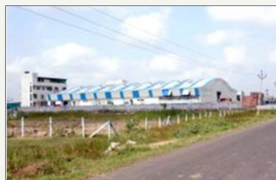
Figure 25: West Coast Frozen Food in Surat.

Harvesting is the last and most important aspect of shrimp farming deciding the profitability of shrimp farms. It is vital to study proper market trend and rate before harvesting season. SAFA member farmers used to decide jointly to get the best price for their product from buyers. Harvesting used to do very carefully with minimum handling to maintain good quality of shrimp with hygienic conditions. Sufficient ration of shrimp to ice is used while packing and transporting to processing plant (Figure 21-24).