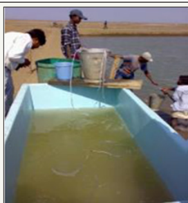
Figure 12: Stocking of post larvae.

E. Weak and died shrimps if any used to separate and discard before stocking into the respective ponds (Figure 11,12).