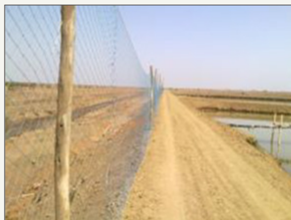
Figure 18: Crab fencing to prevent crab.