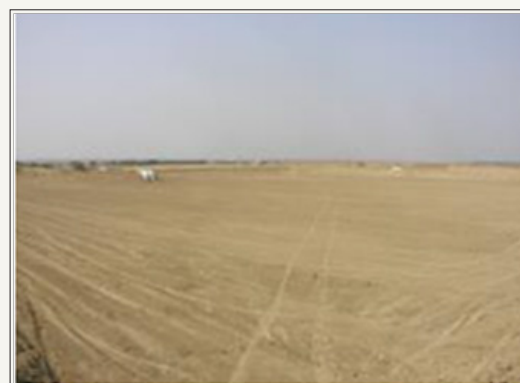
Figure 3: A well constructed pond in Surat area.