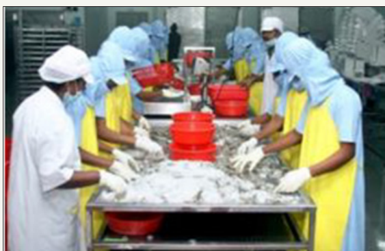
Figure 26: Post harvest practices in plant.

This maintains good quality of final product and commanded better price for farmers. Following figure is showing West Coast Frozen Food Private Limited, processing plant near the farming area in Surat (Figure 25,26).