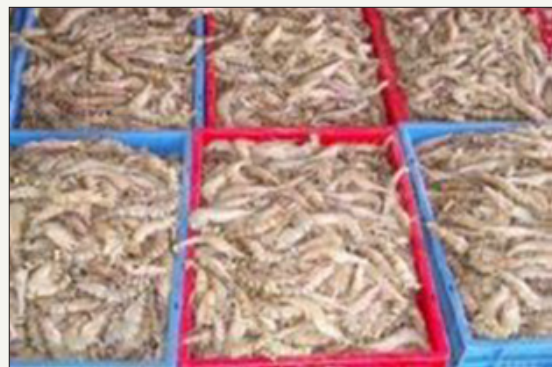
Figure 23: Good quality harvested shrimp.