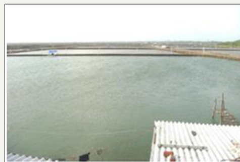
Figure 10: A well prepared pond ready to stock.