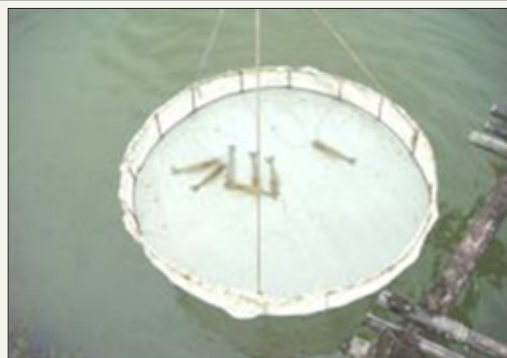
Figure 16: A check tray showing good management.