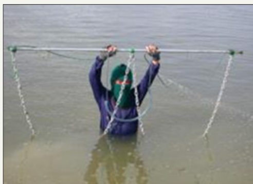
Figure 14: Bottom chain that used for chaining in culture pond.