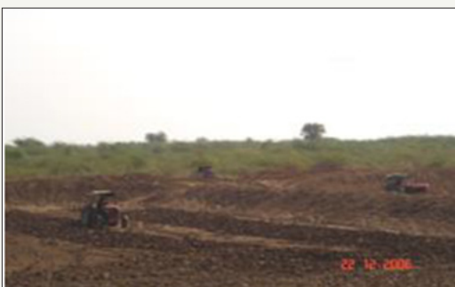
Figure 7: Ploughing during preparation.