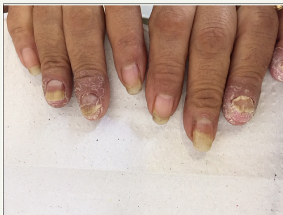
Figure 3: Onychomycosis by Fusarium sp. showing architecture distorted on fingernails.

sp. 1 Aspergillus niger and 1 Scytalidium dimidiatum (Figure 4), Trichophyton mentagrophytes in 2. Among OM patients, 17 were infected with Candida sp. , two were infected by Fusarium sp. , one by Candida sp. associated with Fusarium sp. The patients' records showed that 52 had been suffering symptoms between 1 to 4 years, 45 between 5 to 10 years and 11 reported clinical symptoms for longer than 10 years. Moreover, 61 patients report they had undergone empirical treatment in the past without success (Table 3).