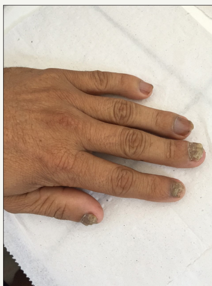
Figure 4: Onychomycosis by Scytalidium dimidiatum characterized by advanced disease involving several nails.