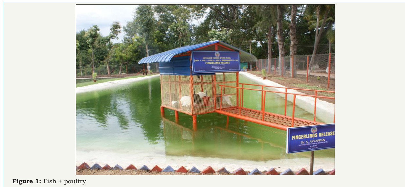
Figure 1: Fish + poultry

Poultry ascending for meat (broilers) or eggs (layers) can be integrated with fish component to lessen costs on manures and feeds in fish culture and augment benefits. Poultry can be raised over or adjacent to the ponds and the poultry excreta recycled to fertilize the fishponds. Raising poultry over the pond has certain favourable circumstances: it boosts the utilisation of space; minimize labour cost in transporting manure to the ponds and the poultry house is more sterile. No significant differences have been observed on the poultry growth or egg laying when they are raised over the ponds or on land. Probably this is called double layer method. Fish in the lower layer, i.e, the upper layer of the water tank and country chicken in the upper layer is the growing method (Figure 1).