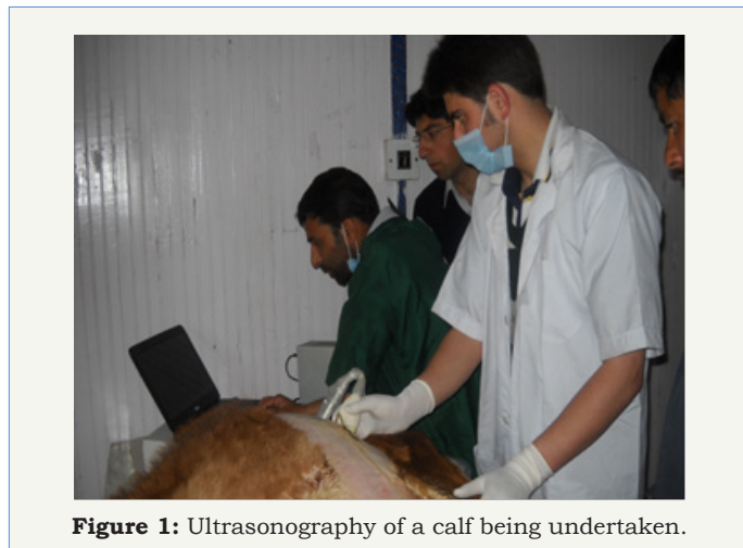
Figure 1: Ultrasonography of a calf being undertaken.

asymptomatic for even decades. USG is a highly sensitive & accurate modality in detecting radiolucent foreign bodies that are difficult to be visualized on standard radiographs (Figure 1).