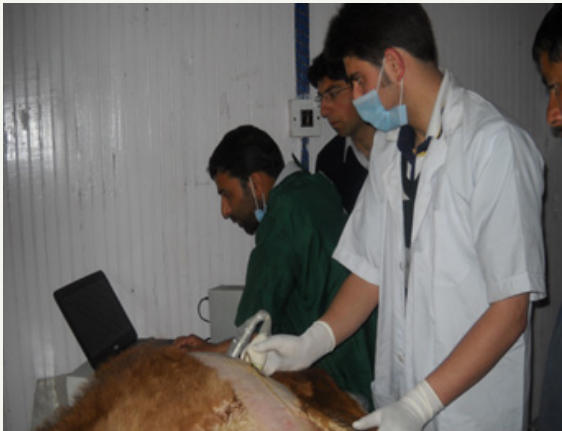
Figure 1: Ultrasonography of a calf being undertaken.

In the end Ultrasonography is an easy applicable, modern & noninvasive method, allowing the visualization of the various organs & their morphological changes. Also the largest advantages of sonography are a relatively simple & effective use, safe to the subject & the operator, its portability & fast interpretation & diagnosis in most circumstances.