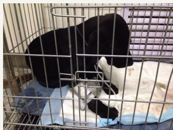
Figure 3: Stretch after operation.

After surgery, the dog wore an Elizabethan collar for 3 days to avoid biting and licking of the surgical site, and kept in a fasting state (Figure 3). During this time, the dog was intravenously injected