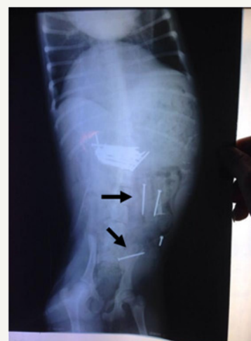
Figure 2: Sagittal reconstructed X-ray image of nails in the stomach and intestinal tract of the dog (black arrows).

A laparotomy sponge was spread across the abdomen and routine surgical site disinfection was performed. Along the ventral midline, a 10cm incision was made from 1cm behind the xiphoid to the front pubis. The abdominal wall was incised layer by layer till the stomach and the intestine were completely exposed. An incision was made to the intestine and 9 nails were taken out from the jejunum. Then the incision was cleaned with warm saline and sutured. The intestine was placed back into the abdominal cavity after being flushed with penicillin saline. Then the stomach was pulled out of the abdominal cavity and an incision was made between the greater and lesser curvature where there were fewer blood vessels. The liquid in the stomach was sucked out, and 45 nails were removed from the stomach in total. The incision was washed and stitched and the stomach was put back. The abdominal cavity was thoroughly rinsed with sterile saline, the abdominal wall and skin were sutured, the incision was disinfected and the edge was covered with a sterilized bandage.