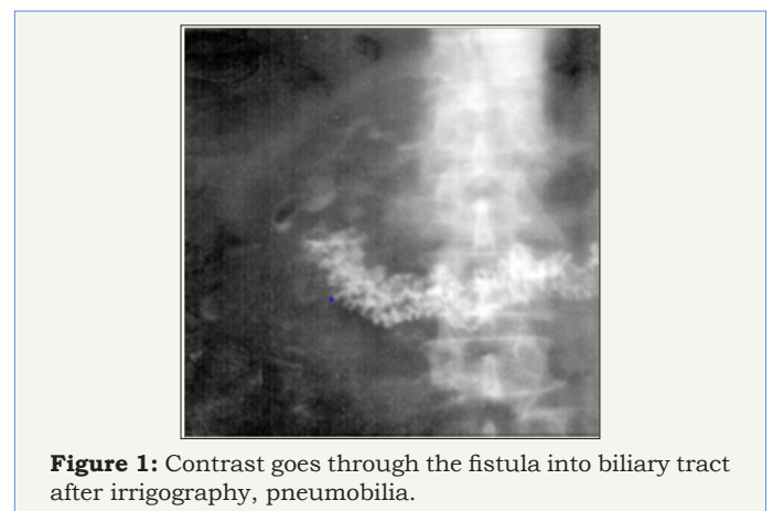
Figure 1: Contrast goes through the fistula into biliary tract after irrigography, pneumobilia.

with calculosis. Gastroduodenography results and passage of the small intestine were normal. Colonoscopy showed no abnormalities. Computerized tomography (CT) of the upper abdomen did not show fistula as well. The diagnosis was reached after irrigography: the contrast entered the gallbladder and biliary tract (Figure 1) [4].