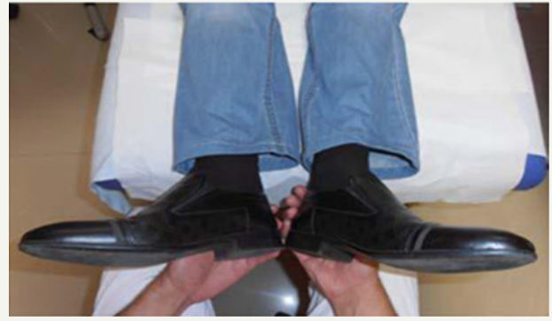
Figure 5: AMT-negative response.