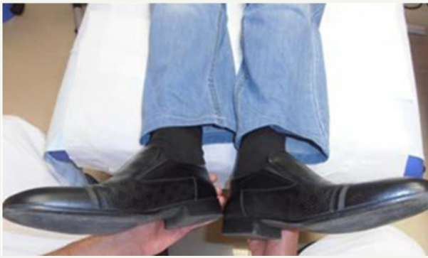
Figure 4: AMT-positive response.