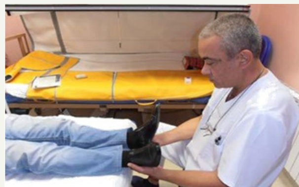
Figure 3: AMT-initial positioning.

A relaxed patient has lied in comfortable position on couch. Patient's feet are placed outside the couch. A contact with the ANS has occurred by verbal stimulation. The patient's response is relaxation only for one of the legs. That reaction means we have a positive reaction to the given information (Figure 3). We assess the muscle relaxation qualitatively-it might be "very good", "good" and "mild". That assessment gives information about the chemo sensitivity. Lack of muscle relaxation means that the reaction is negative and there is chemo resistance to the tested drug. Test time duration is about 15-20min. For the chemo sensitivity registration we fill in a specific blank. At the same time in some patients we have used the test for circulating tumor cells chemosensitivity. It allows both tests results to be compared. No significant differences were established until now. The treatment results in patients cured by IPT and tested by AMT or test for circulating tumor cells chemosensitivity practically were the same. A punctual statistical analysis for the AMT usage could be done in the near future.